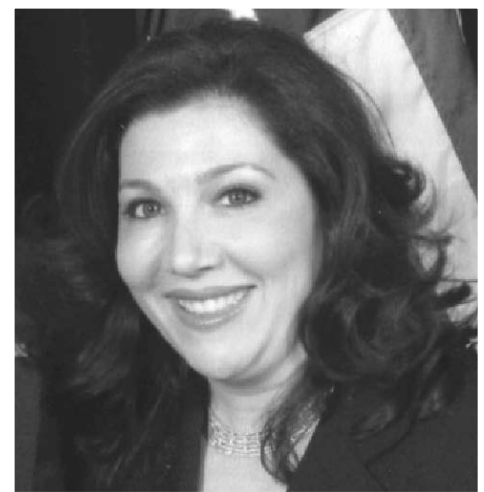
Unlike many past Board of Education members, you did not have an extensive background in PTA prior to getting elected. Do you think that's helped or hurt you?

I think public service takes different paths. I don't think any one is more valid than another. So, I'm very admiring of the PTA, I think they do a tremendous job to really enhance our education at our schools and to fill in the gaps. No, I did not get involved in PTA, other than I was always a member and contributed at the highest level. I think that when you volunteer in some fashion, it has to spark some interest in you and it has to speak to you on some level and I can honestly say that I never really delved into PTA. So it's hard for me now, looking back, to judge why I didn't get involved in PTA but it's certainly not because I have a low opinion of PTA. Quite the opposite, I think they do a fantastic job and I'm always impressed at how often these parents are volunteering, coordinating and giving so much of their free time. I was doing another volunteer work that I felt in many ways prepared me for the Board. I believe there are many paths to public service and each are valid in their own way and each give you a different skill set.