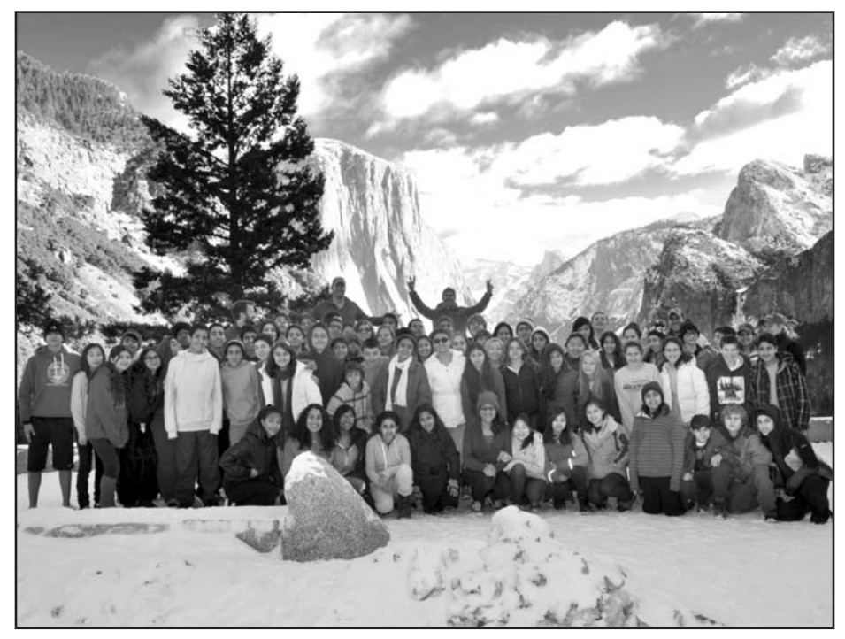
Hawthorne eighth graders hike in Yosemite National Park

Hawthorne school eighth graders group spent five days at Yosemite National Park from Jan. 7 to Jan. 11 learning about teamwork, leadership, ecology and the history of the park and its native people.