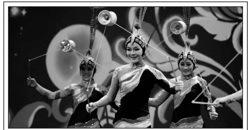
Members of the China National Acrobatic Troupe at last year's celebration