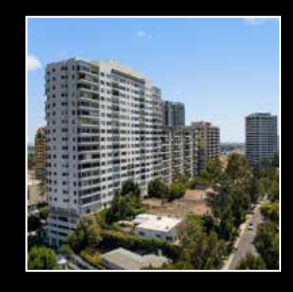
Just Leased | Wilshire Corridor 10501 Wilshire Blvd #2111 Westwood Leased for $5,300