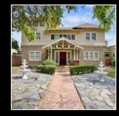
Just Sold | Historical Property 2524 9th Ave West Adams Sold for $951,000