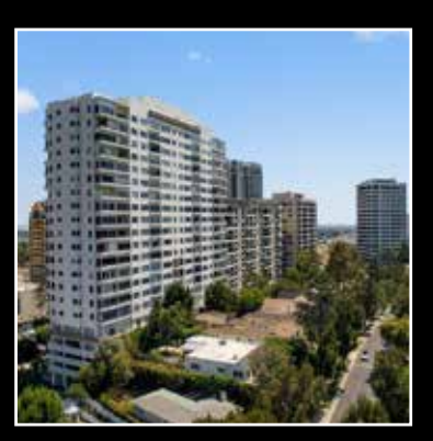
For Lease | Wilshire Corridor 10501 Wilshire Blvd #906 Westwood $3,500/Monthly