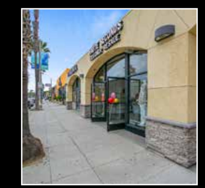
For Lease | Restaurant/Retail 2629 Wilshire Blvd

301 Lorraine Blvd Hancock Park $13,900/Monthly