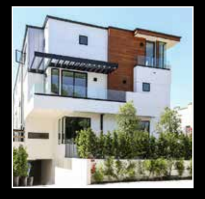
Just Sold | New Construction 829 N Martel #4 West Hollywood Sold for $1,230,000