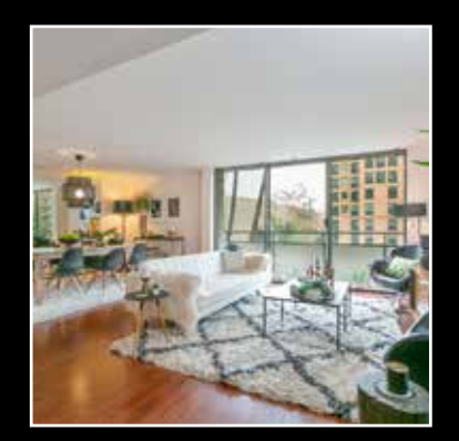
Just Sold | Wilshire Corridor 10535 Wilshire Blvd #411 Westwood Sold for $815,000