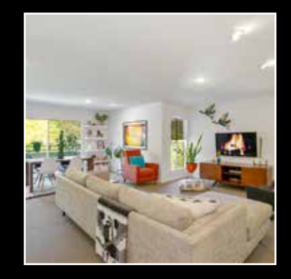
For Lease | Designer Condo 6736 Hillpark #302 Hollywood Hills $2,875/Monthly