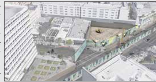
Renderings of what piling could look like on the north side of Wilshire