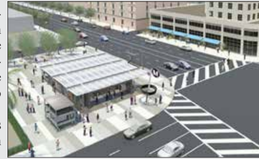
Rendering of proposed Wilshire/Rodeo Station

After closing comment for the scoping period, Metro will conduct a 45-day public review period and public hearing between Fall of this year through Spring 2020 to address the drafted EIR and select a preferred alternative.