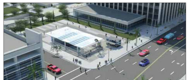
Proposed Wilshire/La Cienega Station

Hauling hours are anticipated to increase as excavation continues under