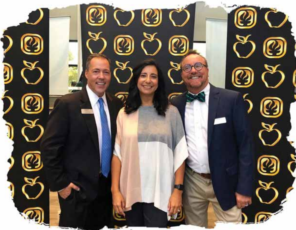
TEACHER OF THE YEAR UNIVERSAL CITY