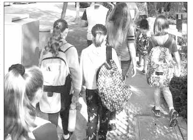
Hawthorne Students on "Walk to School Wednesday"

Students and parents meet in front of Kelly's Coffee at the Beverly Hills Library at 8:45 a.m. to walk together to campus.