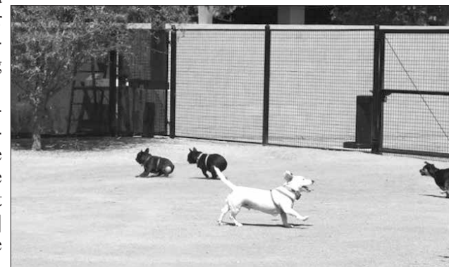
Current Decomposed Granite Surface at Beverly Hills Dog Park