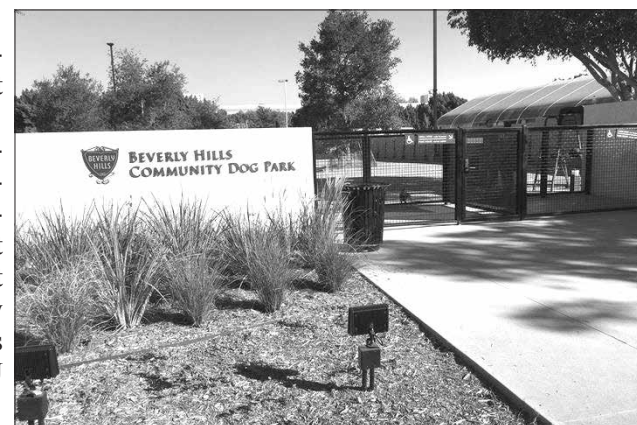
Beverly Hills Community Dog Park

ceived since the start of the dog park [with the DG surface] is that when the dogs are running in the hotter summer months, the