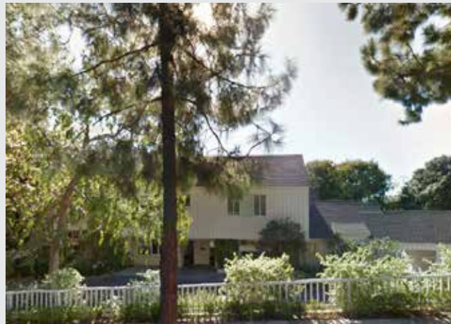
959 Alpine Drive as of October 2015

Residents of the Hillside area spoke in support of the applicant’s proposed changes to the property at the most recent planning commission last week.