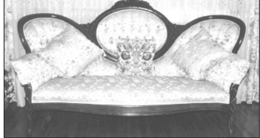
MADE-TO-ORDER FRAMES Featured in many magazines including Architectural Digest

Appointment Suggested (323) 930-1406 5186 W. Adams Blvd. Los Angeles, CA 90016