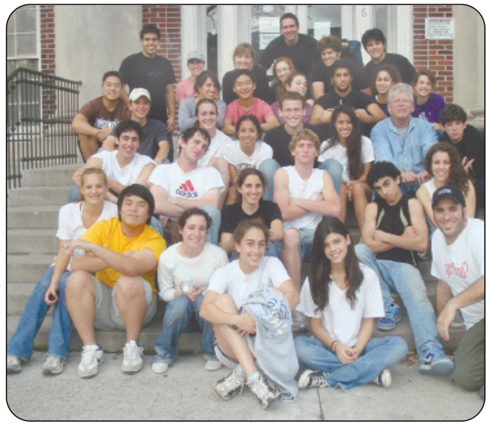
beople and got an amazing email back from the Hilton telling us that they had comped all 11 of our rooms and one of our students in our class helped to facilitate a grant from Wells Fargo, which went toward air fare And

It was so much better [then it was in March]. The city was a lot more lively, there were people. In the ninth ward, where we worked, it wasn't that different. There were a few houses that were built but there was still trash everywhere. It's still the same in the ninth ward as it was [in March]. I think people assume that New Orleans is completely destroyed, and parts of it are really completely destroyed but in the areas that most tourists