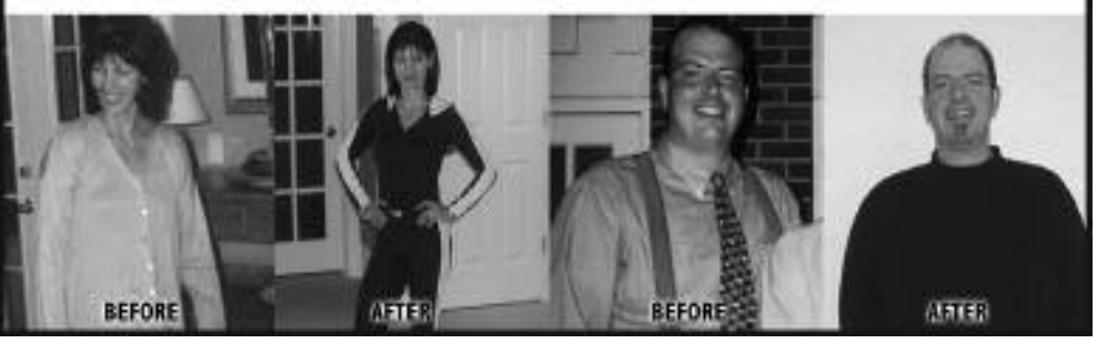
Page 6 • Beverly Hills Weekly

It's patented, it's easy, it's nutritionally balanced – and it's PROVEN to work!