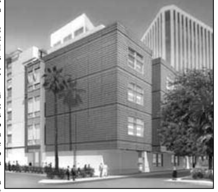
Science and Math Technology Building

The new building at Elm and Charleville houses three brand new kindergarten class-rooms, a new band room and music room. Two-new pre-school classes will also be