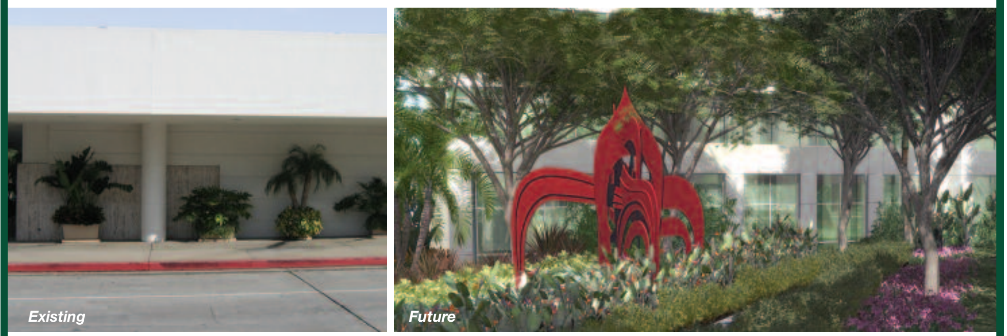
Merv Griffin Way today and as it will look after the revitalization.