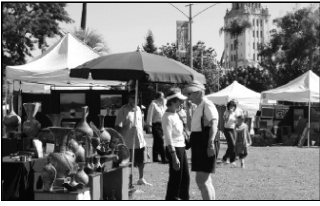
Beverly Hills' semi-annual Affaire in the Gardens Art Show to be held May 17 and 18 from 10 a.m. to 6 p.m. (both days) in Beverly Gardens Park – spanning four blocks