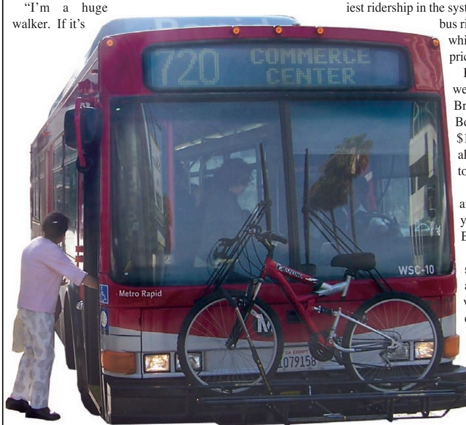
Page 10 • Beverly Hills Weekly

"I've found that there are fewer cars on the road. In the afternoons now, the freeways are flowing. So maybe that's the upside to the gas prices," said Frenn, half-heartedly joking. "But really, I hope it triggers our government into looking into alternative fuels. Maybe [higher gas prices] will make it clear that we've got to move toward alternative fuels."