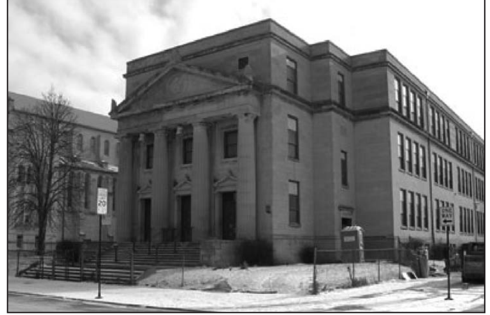
Page 6 • Beverly Hills Weekly

There are small houses and apartments around it. Some are dilapidated.