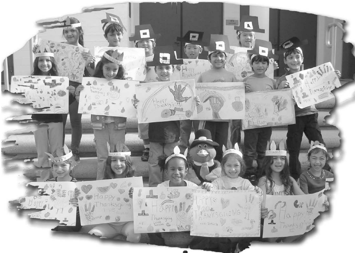
HAWTHORNE ANGELS NORTH REXFORD DRIVE