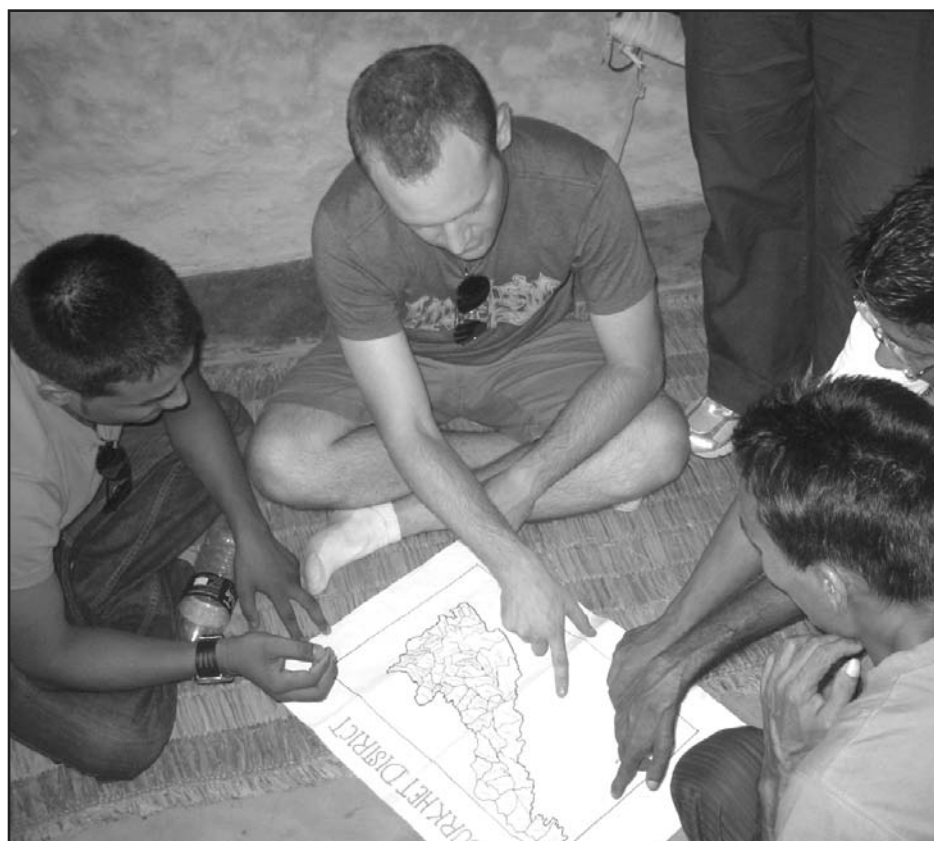
Global HEED members plan a strategy for assessing a community's needs in a Nepal village.