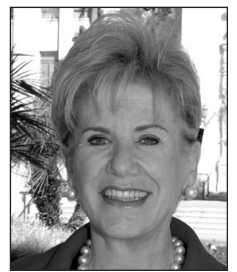
Tell me about some of the city's plans for 2010?

My plans are to get out of it alive. To tell you the truth, first of all, I'd like to finish out the year peacefully. I'd like to have a healthy prosperous year. My goal as the mayor has always been to support our local businesses and the residents. And I'd like to have a smooth transition to the incoming mayor [in March] and to the business community so they can have a prosperous 2010 with a healthy, safe year to follow.