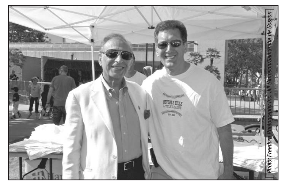
Beverly Hills Little League Closing Festivities

The Beverly Hills Athletic Alumni Association will be hosting Alumni Day