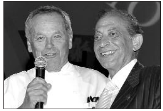
Wolfgang Puck and Mayor Jimmy Delshad