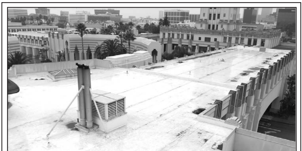
Solar panels will be installed on top of the Civic Center to generate clean energy.