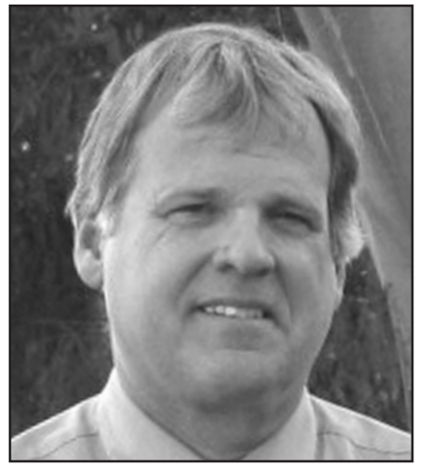
How did you come to work in this position?

I first started in [Beverly Hills in] 1983 as recreation supervisor. I left the city in 1992 as I'd been promoted to [a] senior recreation position. I went to Washington and [the] city of Olympia [and I] became assistant director there for five years.