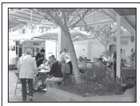
Roxbury Park Community Center courtyard

Replacing Building A would widen the cor-