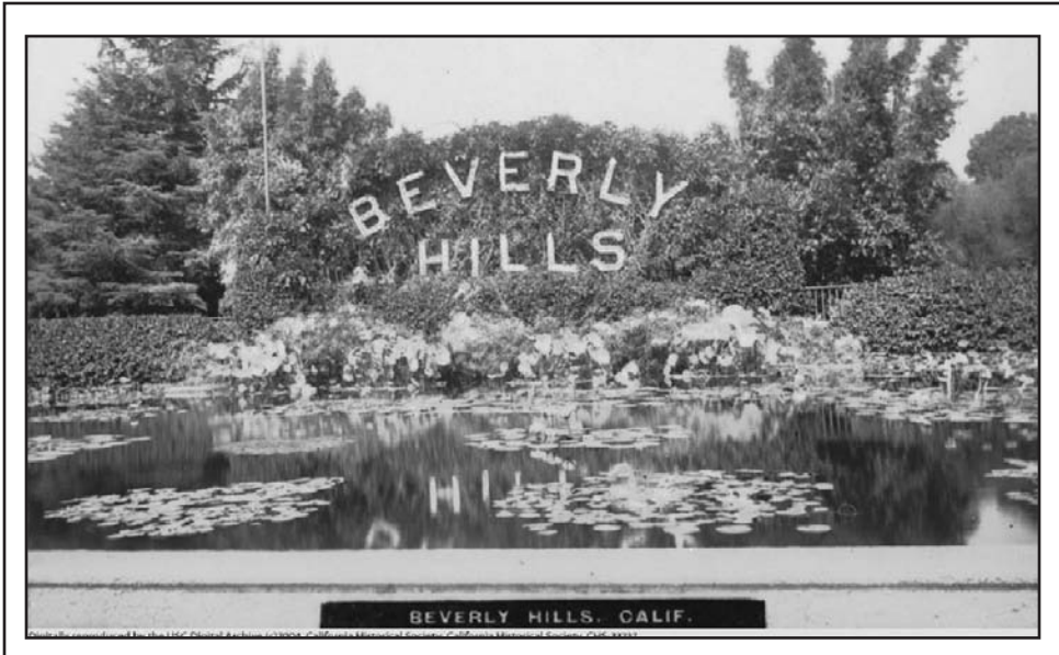
A USC Digital Archives photo shows the lily pond in Beverly Gardens Park, circa 1920

Paysinger was not immediately available for comment.