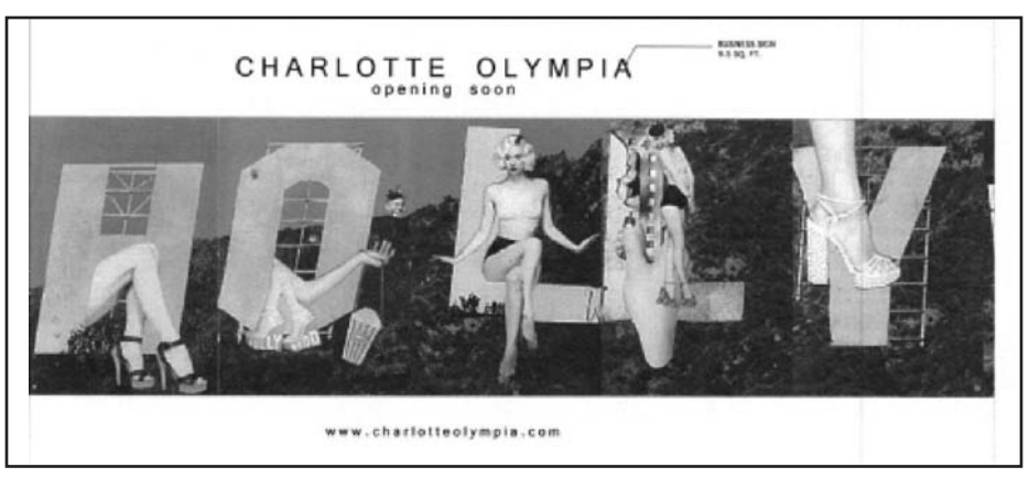
Proposed construction barricade