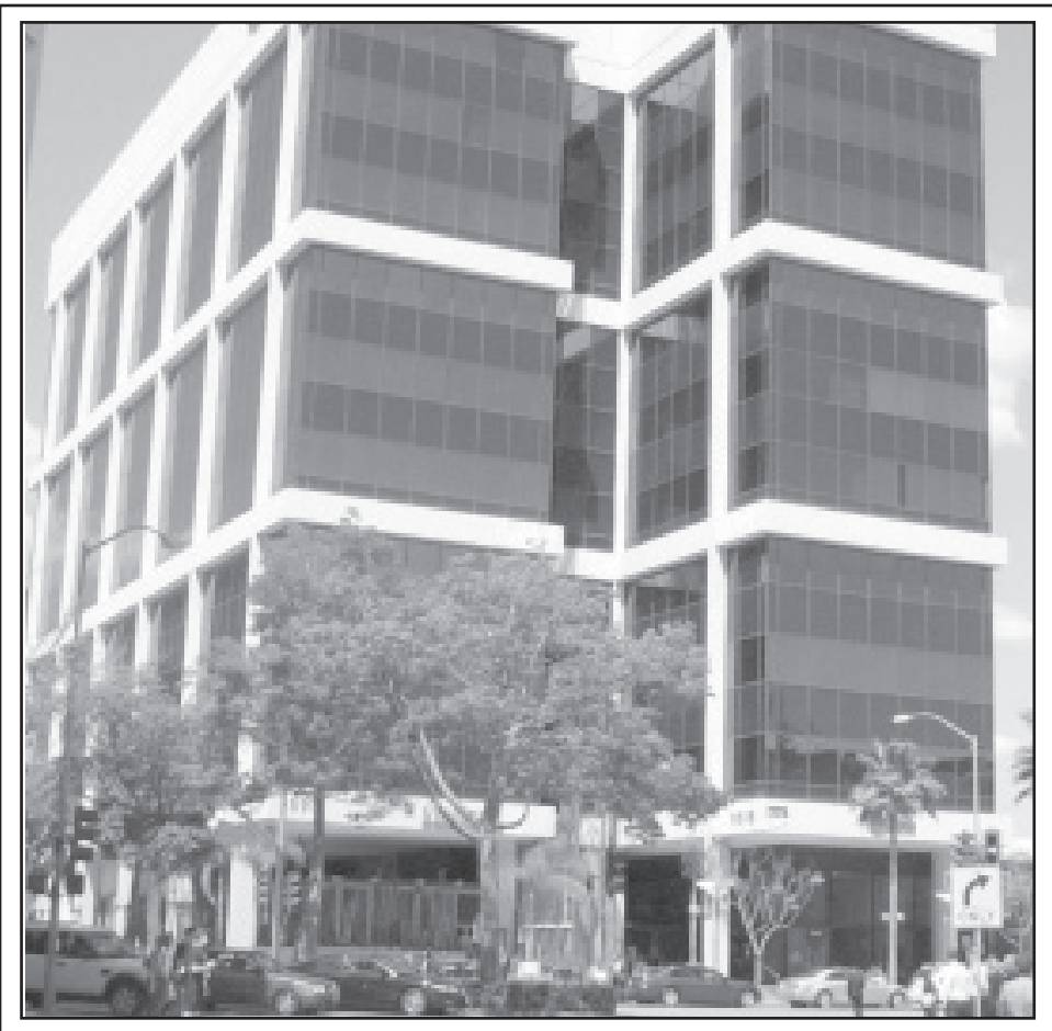
9595 Wilshire Boulevard, proposed restaurant will be on ground floor