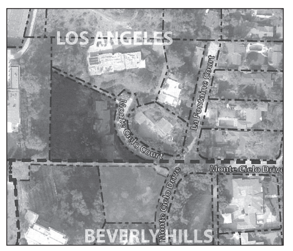
Top shaded area is located in Los Angeles, bottom shaded area is located in Beverly Hills, and the middle shaded area is the 10-foot wide strip of land that belongs to the City of Beverly Hills

The case of the American Federation of State etc. Employees v. Regents of University of California states that there are Briefs cont. on page 7