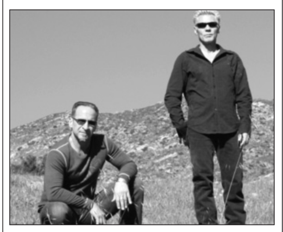
Dakota to perform on August 7