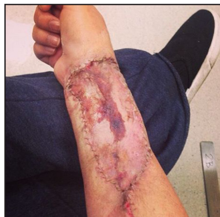
Angelina's forearm skin was removed to create tongue

They were actually able to pull some fore-