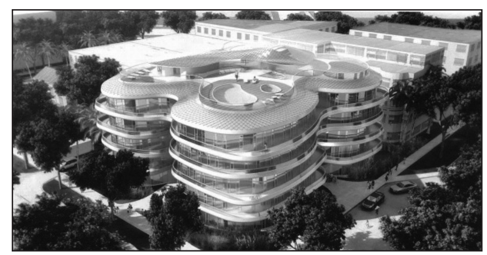
Rendering of proposed building

Through issuance of an R-4 permit, the Zone Text Amendment would waive the current requirement that a minimum of 60% and a maximum of 70% of the front façade of the first two stories of a large-scale multiple residential project must be built to the front setback line. The proposed project's undulating design does not conform to some development standards relating to building façade modulation.