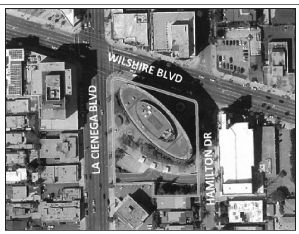
8484 Wilshire Boulevard

The COC shall issue regular reports on the results of its activities. A report shall be issued at least once a year. Minutes of the proceedings of the COC and all documents