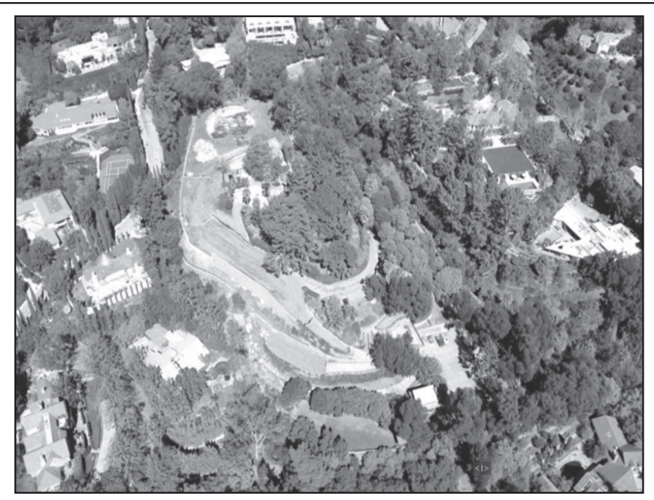
Project site and vicinity