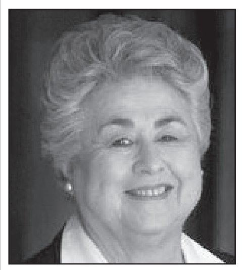
You were elected to the LA Council in 1953 at age 22. What was that like?

Well it was quite remarkable; it was a headline in the Los Angeles Times saying "It's a Girl." And when I gave birth it said "City Dad Gives Birth." That was another headline. I had two kids when I was on the City Council. The whole story went across America, by the way, I was the youngest woman—somebody said that I was the youngest woman ever elected at that