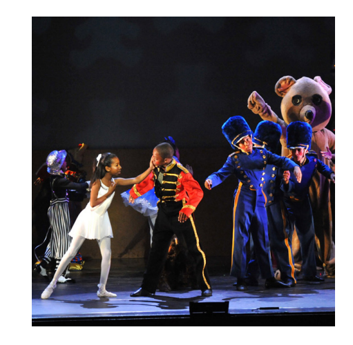
MOLLY RINGWALD THE HOT CHOCOLATE NUTCRACKER A Debbie Allen Production