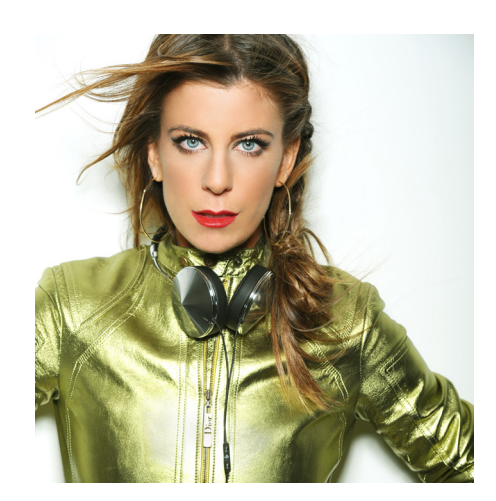
DJ MICHELLE PESCE International Celebrity DJ