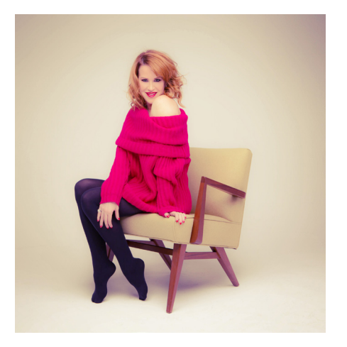
Actor, Jazz Vocalist, Writer