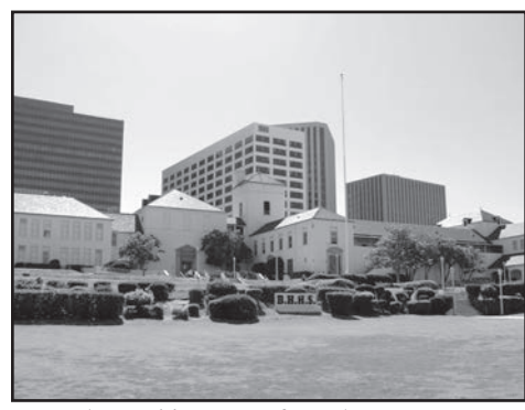
Beverly High's iconic front lawn

Late last month, the Board gave Totum Consulting direction to solidify fencing