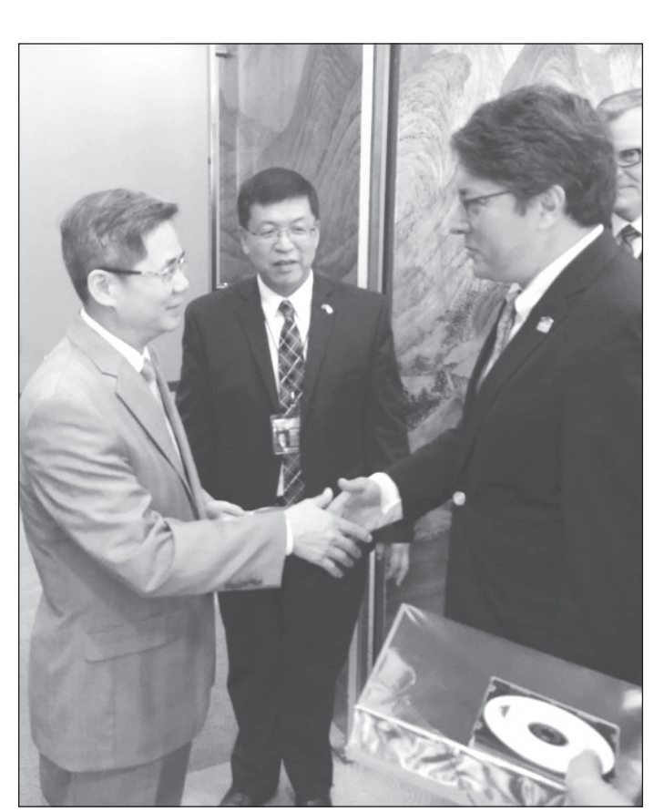
China's Vice Foreign Minister Zheng Zeguang and Mirisch

Connections between countries are important because it's not only a global economy-it's become a global village. The more we are able to connect and find commonalities and common ground about what unites us, the world will not only become safer, but also more prosperous. China is one of our more important trading partners. With 1.4 billion people, China is certainly one of the most important countries in the world, and it's important for us to understand each other. If we can