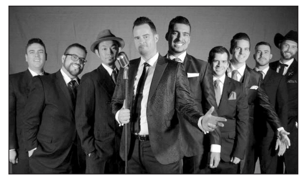
Phat Cat Swinger