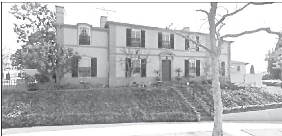
9570 Virginia Place

privacy of not only Kahan’s property but also the neighbor’s directly across the street. She also suggested the addition of the garage alone would be intrusive of the streetscape.