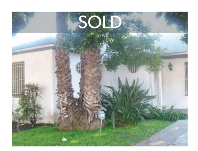
316 N. Crescent Heights | Beverly Center On the market 859 days with previous brokers!