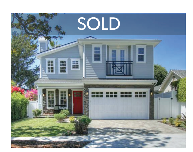
639 N. Sierra Bonita Ave | West Hollywood On the market 271 days with previous broker!