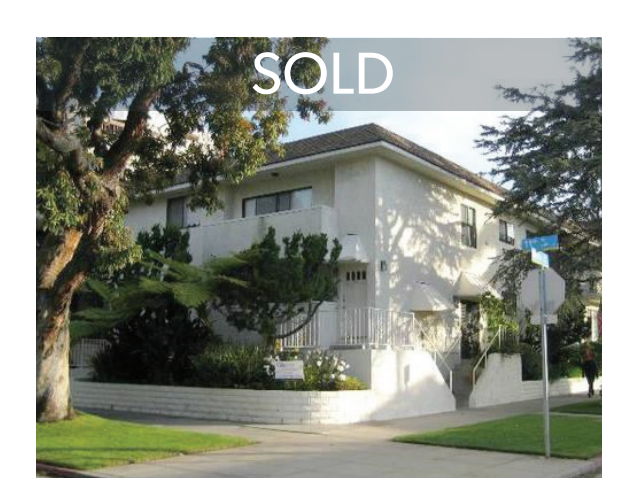
1105 Idaho Ave. #208 | Santa Monica On the market 214 days with previous brokers!