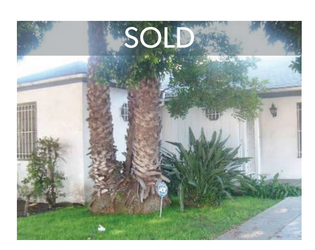
316 N. Crescent Heights | Beverly Center On the market 859 days with previous brokers!