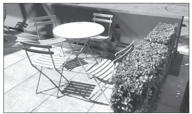
Bistro seating on Rodeo Drive