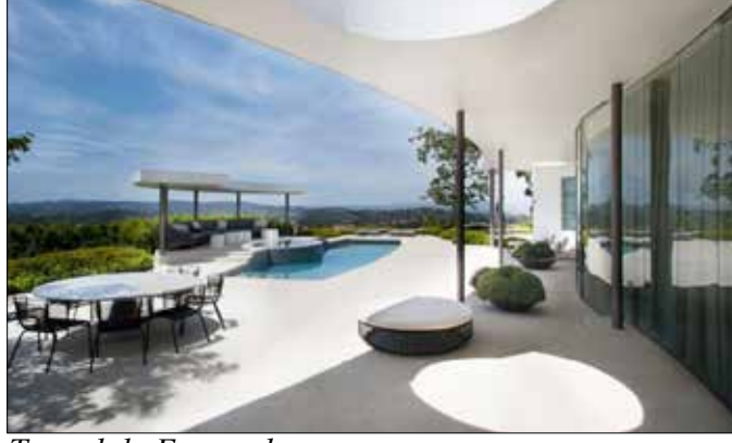
Trousdale Estates home

the Beverly Hills Planning Commission asked staff to draft an ordinance banning the building of accessory structures off the level pad in the Trousdale Estates area of the city. This decision follows a previous