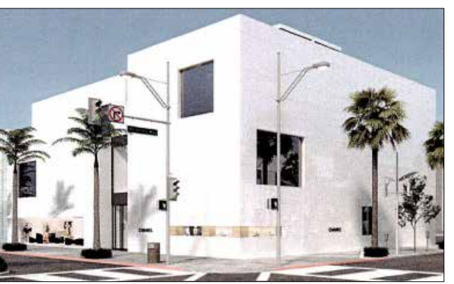
lot," Platt said. "To me, Chanel rendering from corner of Rodeo Drive and

At its latest meeting on December 12, the Beverly Hills Architectural Commission reviewed a proposal for the construction of a new three-story Chanel retail building located at 400 North Rodeo