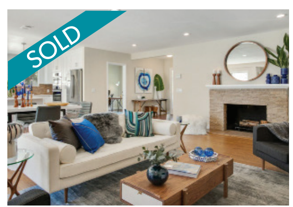
12420 Albers | Valley Village Listed at $998,000 | Sold for $1,051,000 On the market for 5 months with previous broken