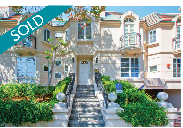
309 Almont | Beverly Hills Listed at $1,249,000 | Sold for $1,425,000