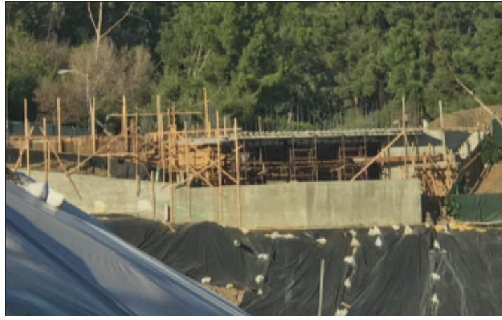
Calle Vista land form disfiguration

Regarding the pipeline projects, residents have argued that the pending projects could have negative impacts on the neighborhood and surrounding proper-