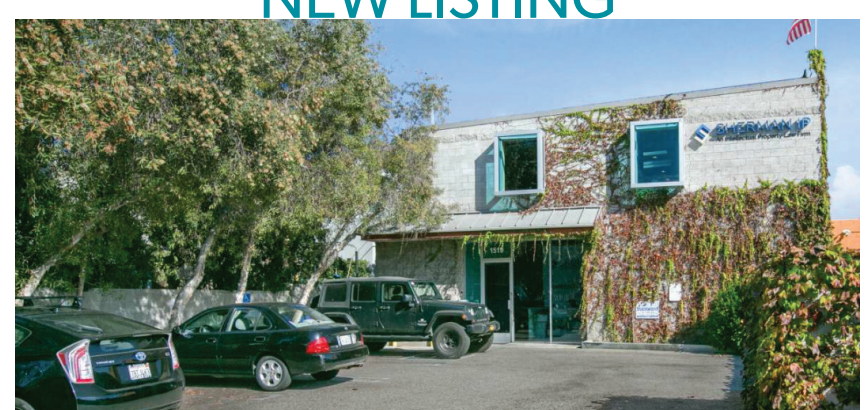
1519 26th Street | Santa Monica Listed at $6,250/mo

WANT A PROFESSIONAL EVALUATION OF YOUR PROPERTY?