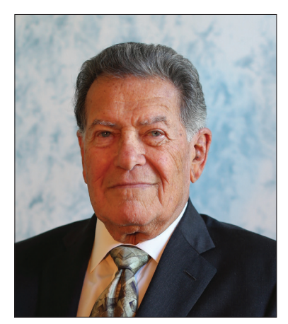
"All we would do if we did pass a parcel tax is fund the status quo"

"All we would do if we did pass a parcel tax is fund the status quo," said