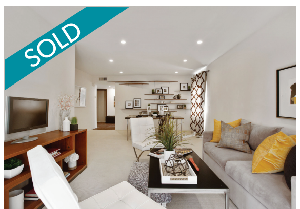
6728 Hillpark | Hollywood Hills Listed at $459,000 | Sold for $495,000 On the market 129 days with previous broker