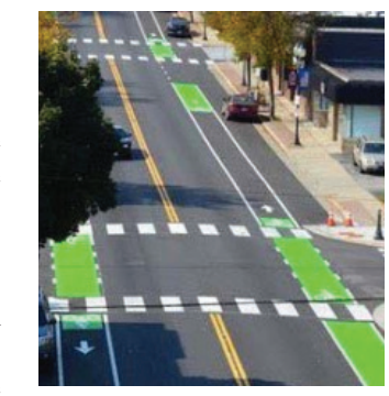
Green Bicycle Lane Treatments`