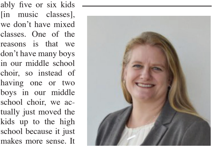
"They've grown up together; that's the [thing] about being a small, small school they all know each other."

they're doing the same thing. I actually came from there. They're planning a 6-12 also; they're just gonna have a STEAM [Science, Technology, Engineering, Art, Math] focus. They're a pretty big district, so theirs is going to be more of a magnet type school program where there are applications.