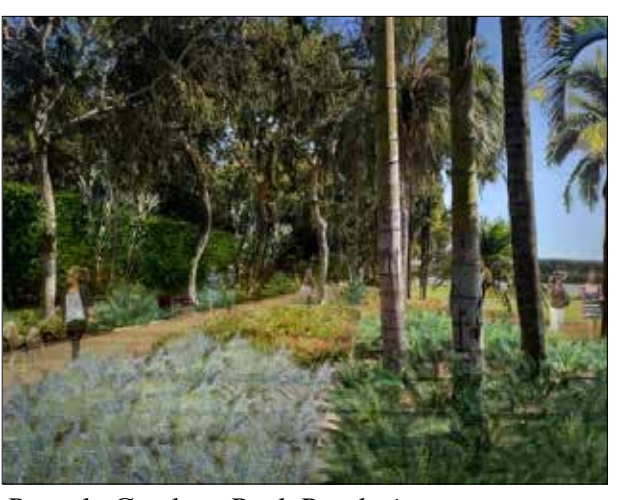
Beverly Gardens Park Rendering

In addition, intermittent blocks between Doheny Drive and Arden Drive will be closed to allow for construction, beginning with the block from Alpine Drive to Foothill Road, and four blocks between Arden Drive and Doheny Drive.