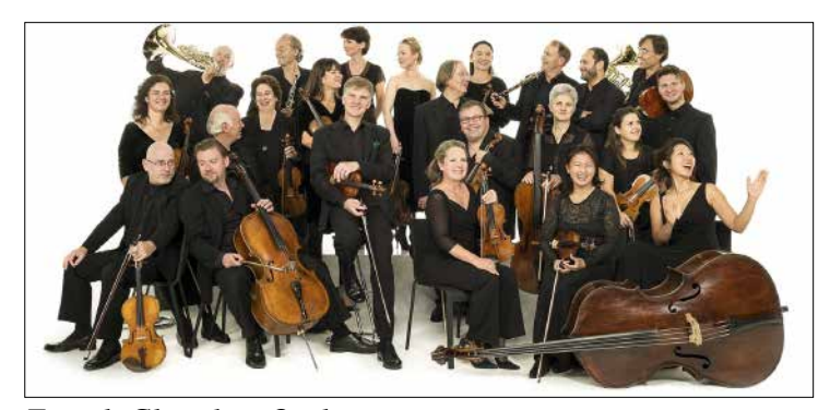
Zurich Chamber Orchestra

This season, Preludes @ The Wallis returns to enhance the audience experience, providing a free pre-concert conversation with artists and special guests one hour prior to each Music @ The Wallis