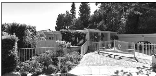
1111 Maytor Place

sued the 1100 Maytor Place property owner an order requiring compliance with the City's hedge height regulations by November 16, 2017. The foliage owner's attorney subsequently requested an extension to the compliance order and the City granted an extension through January 16.