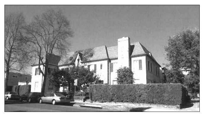
157 South Crescent Drive

According to the staff report, "minimal changes" have occurred to the exterior appearance of the property allowing it to retain "substantial integrity" from its pe-