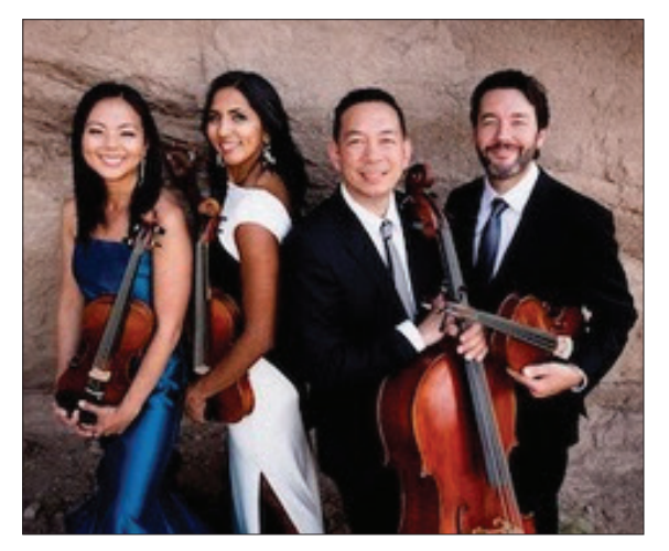
burn Foundation, The Berklee College of Music, The Aaron Copland Fund for Music, City of Los Angeles Department of Cultural Affairs, National Endowment for the Arts, Los Angeles County Arts Commission, and individual contributions.