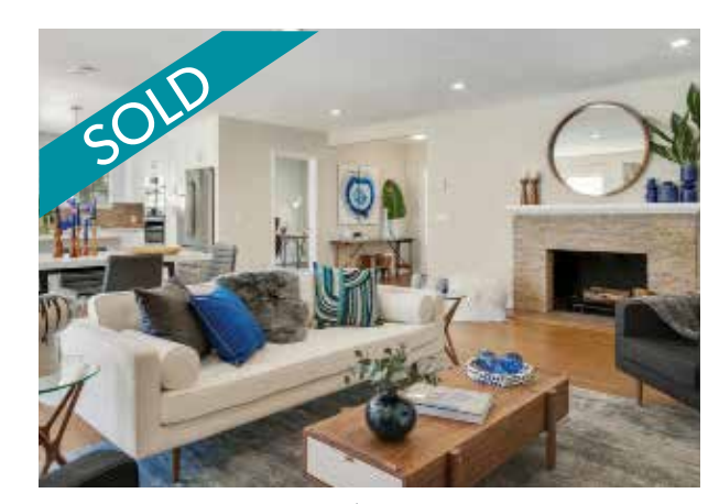
12420 Albers | Valley Village Listed at $998,000 | Sold for $1,051,000 On the market for 5 months with previous broker