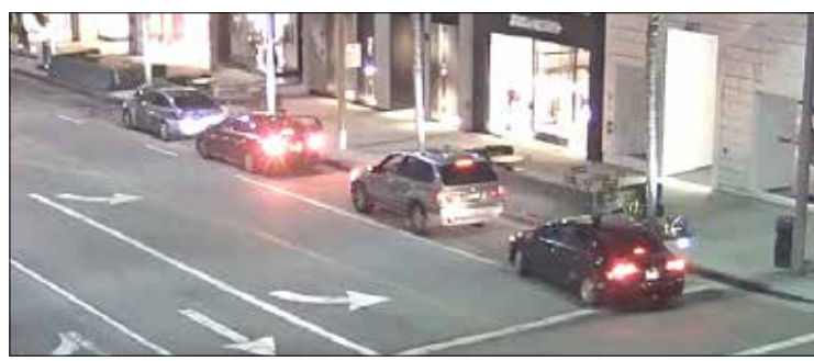
469 N. Rodeo Drive

The pursuit terminated in the area of Cloverdale Avenue and Rodeo Road in the City of Los Angeles, when the driver abruptly stopped, and all passengers (four to six males) exited the vehicle and fled on foot. None of the suspects were apprehended. The suspect vehicle was recovered by police. Several items of stolen