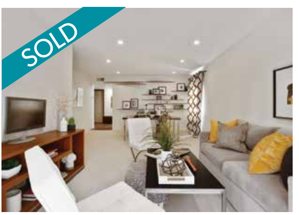
6728 Hillpark | Hollywood Hills Listed at $459,000 | Sold for $495,000 On the market 129 days with previous broker