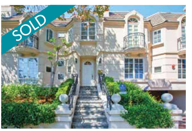
309 Almont | Beverly Hills Listed at $1,249,000 | Sold for $1,425,000