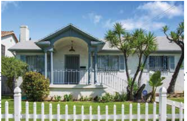
6215 Drexel I Beverly Center