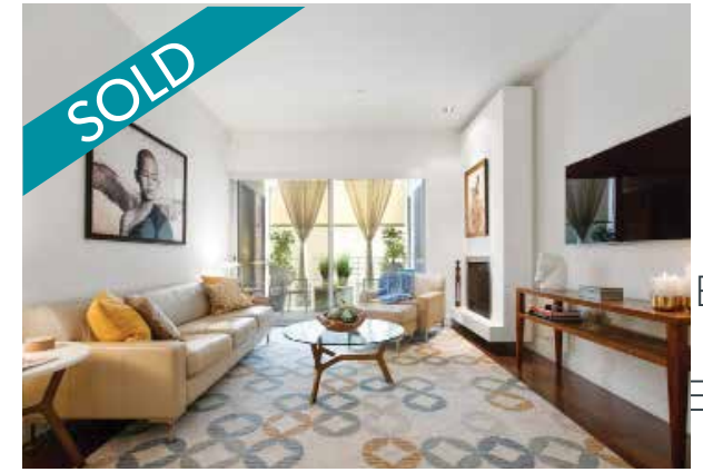
6735 Yucca Street #207 | Hollywood Listed at $695,000 | Sold For 705,000 On the market for 58 days with previous agent