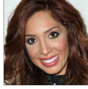
that he Farrah Abraham

A male adult hotel security officer reported