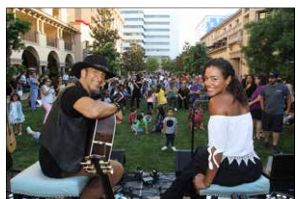
Amber & Smoke

Canon Gardens. Next week, July 12, will feature Amber & Smoke at the same time and place.