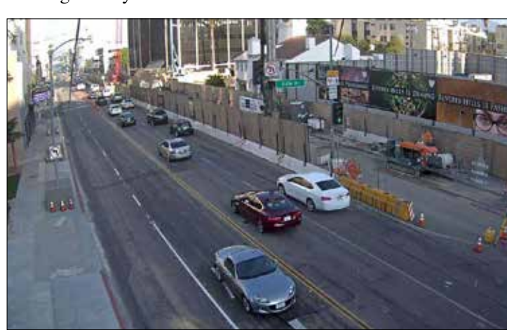
Piling on Wilshire between Gale and La Cienega

Metro announced its tentative timeline for completing construction of its Purple Line Extension project at its community meeting on July 11.