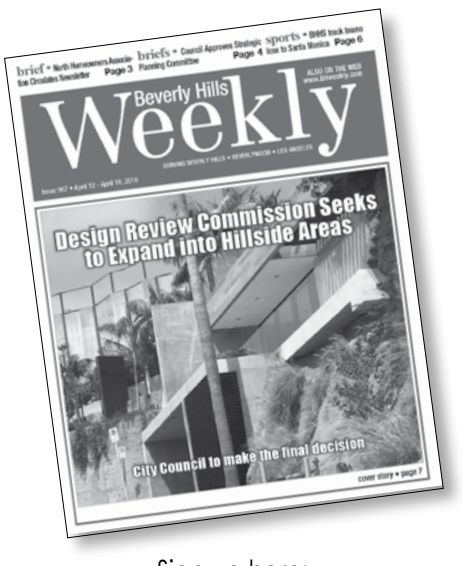
Sign up here: http://eepurl.com/zfU-L