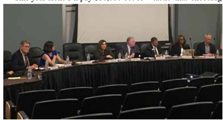
Beverly Hills Board of Education at August 28 meeting

"This year alone I'll pay $10,000 out of