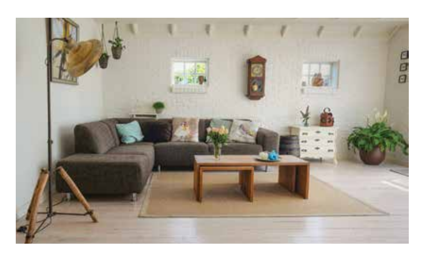
SOLD: 305 S Glenwood, Burbank