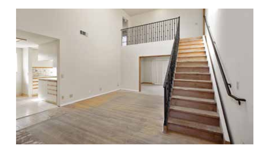
SOLD: 426 Via Vista, Redlands (Sold in Probate)