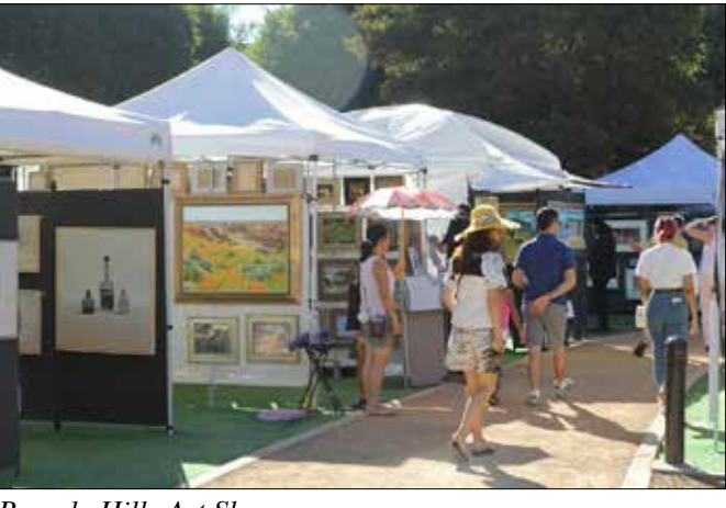
Beverly Hills Art Show

The Beverly Hills Police Department will host its second annual Cops, Cars and Coffee event on October 13 on the 9300