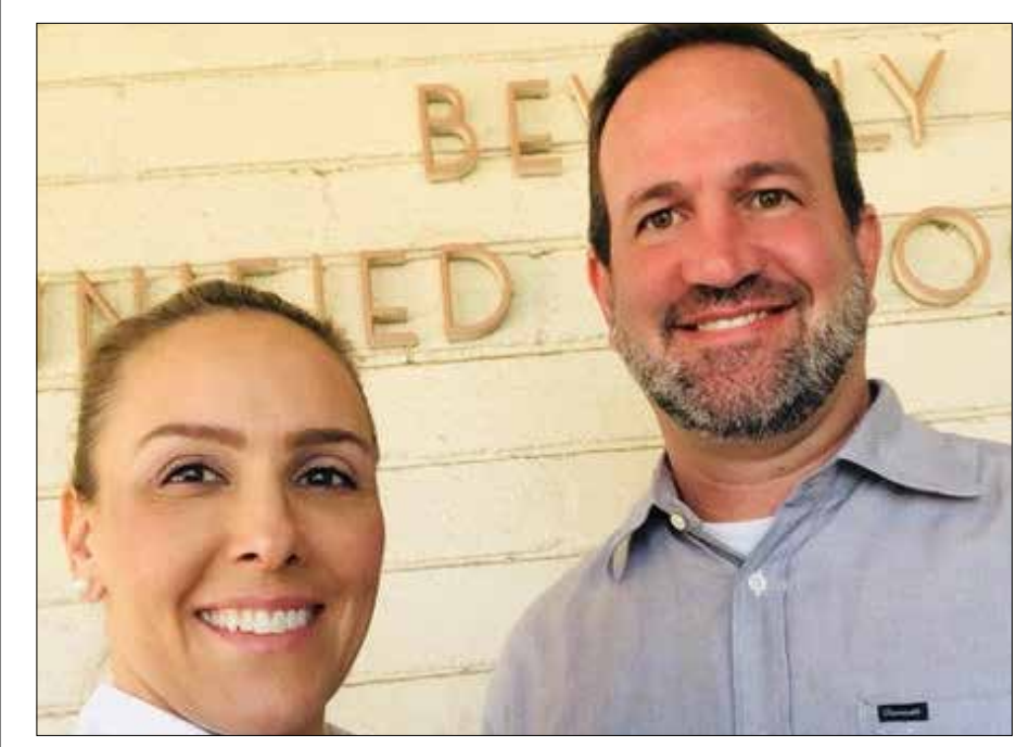
$5000 for BHEF

the grant. The first will focus on immune checkpoint inhibitors, proteins secreted by cancer cells to prevent immune cells from detecting them, and will be led by Noble.