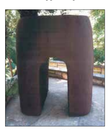
"Iron Doorway" by Jene Highstein

Highstein has worked as artist an for four decades. focusing largely on variations of archetypal forms such cones, c v l i n -