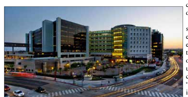
Cedars-Sinai Medical Center

Idiopathic pulmonary fibrosis, which scars lung tissue and obstructs breathing, affects more than 100,000 people in the U.S. While the course of the disease of-