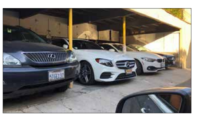
letters cont. on page 3

This is a photograph (see below) showing the cars parked at the apartment build-