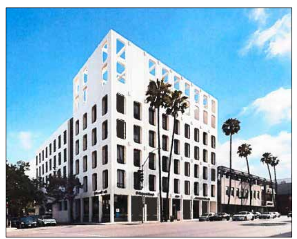
9300 Wilshire Boulevard two landmarks brings the total number of properties on the register to 42.

The City Council voted last Tuesday to formally place two new properties on the Beverly Hills Register of Historic Properties, the Wilshire-Rexford Office Building located at 9300 Wilshire Boulevard and the David O. Selznick Residence at 1050 Summit Drive. The addition of the