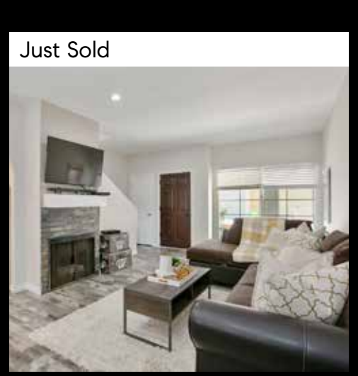
856 Beach Ave #13 | Inglewood