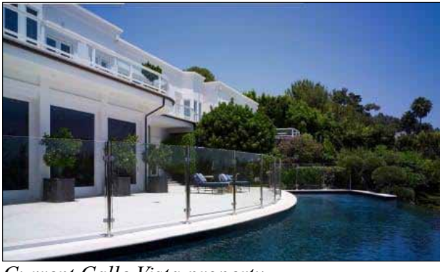
Current Calle Vista property

The commission found that the Municipal Code's intent was not to prevent properties with legally nonconforming structures as to maximum allowable floor area from seeking the permit. Accordingly, they voted 3-2, again with Commissioners Gordon and Ostroff dissenting, to approve the requested three Hillside R-1 Permits for