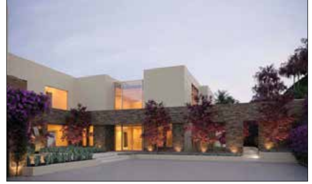
Calle Vista project rendering

Individual tickets and sponsorship packages for the 12th annual Beverly Hills Ball are available online at www. beverlyhillsball.com.